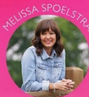
Author & Bible Teacher